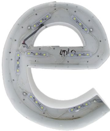
Sign letter utilizing TRIOBRIGHT Modules