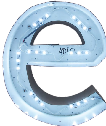
Sign letter lit up